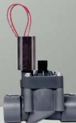
1" Valve with Flow Control